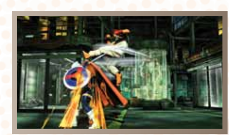
Repeatedly doing air Tatsumaki Senpukyaku L is a great way to apply pressure to cornered opponents. It also can be used as a cross-up!

Ryu can also place the opponent in a strong mix-up whenever you get into throw range—see the Advanced Tactics section for details.