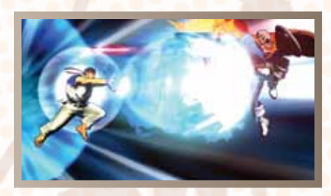
Ryu is one of the few characters that can quickly attack the Air S is Ryu's best air-to-ground attack. It also can be opposite end of the screen at any height. Take advantage of used as a cross-up in some situations. this to counter lots of tactics!