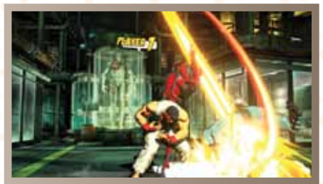
Fast, OTG-capable crossover assists like Deadpool— \beta greatly increase Ryu's damage potential after ground and air throws