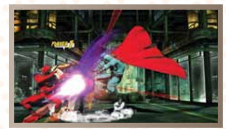
The Shoryuken attack used by Ryu—α is not invincible at all! Use one of the other two assist types instead!

Ryu's Hadoken assist type is an all-around great tool for any character, being one of the more versatile assists in the game. Projectile-based assists can be used for cover fire, teleport cross-ups, pinning your adversary down with guardstun, and nearly an infinite number of other applications.